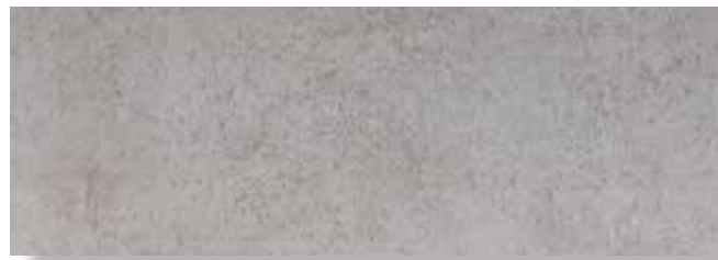
PARK SILVER 31,6x90x0,9cm Butech recomienda junta / Butech recommends joint: Colorstuk Rapid n Cemento B22502013 / 100004305