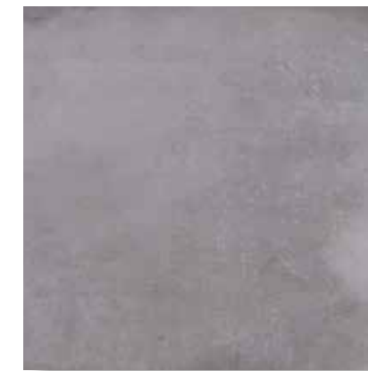
TRIBECA SILVER S-R 59,6x59,6x1,1cm P1856922 / 100145388 G354 Butech recomienda junta / Butech recommends joint: Colorstuk Rapid n Cemento B22502004 / 100004297