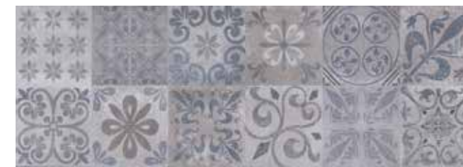
ANTIQUE BLUE 31,6x90x0,9cm Butech recomienda junta / Butech recommends joint: Colorstuk Rapid n Cemento B22502013 / 100004305