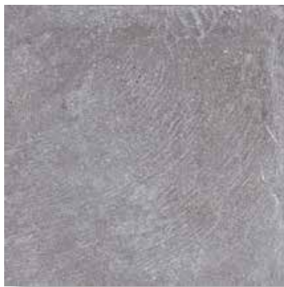
PARK SILVER S-R 59,6x59,6x1,1cm P1856921 / 100145385 G354 Butech recomienda junta / Butech recommends joint: Colorstuk Rapid n Cemento B22502004 / 100004297