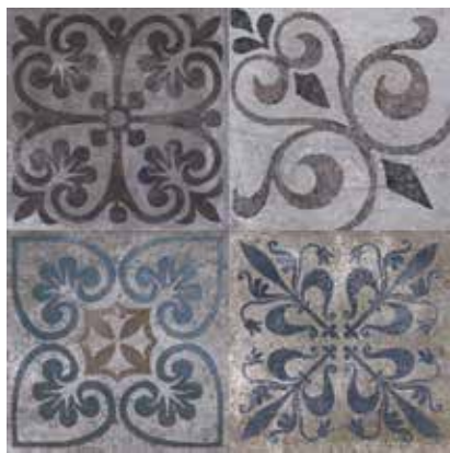
ANTIQUE SILVER S-R 59,6x59,6x1,1cm P1856930 / 100145533 G359 Butech recomienda junta / Butech recommends joint: Colorstuk Rapid n Cemento B22502004 / 100004297