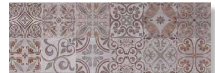
ANTIQUE BROWN 31,6x90x0,9cm Butech recomienda junta / Butech recommends joint: Colorstuk Rapid n Cemento B22502013 / 100004305