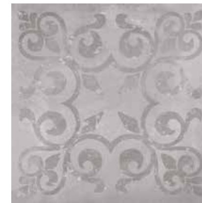
DECO TRIBECA ACERO S-R 80x80x1,2cm P1760065 / 100148216 G372 59,6x59,6x1,1cm P1856926 / 100145489 G359 Butech recomienda junta / Butech recommends joint: Colorstuk Rapid n Manhattan B22502002 / 100004295