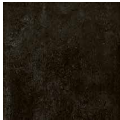
PARK BLACK S-R 59,6x59,6x1,1cm P1856928 / 100145728 G354 Butech recomienda junta / Butech recommends joint: Colorstuk Rapid n Negro B22502006 / 100004299