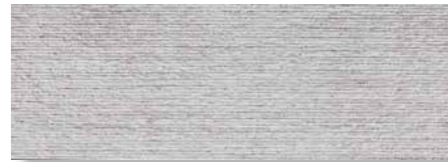
PARK LINEAL ACERO 31,6x90x0,95cm Butech recomienda junta / Butech recommends joint: Colorstuk Rapid n Manhattan B22502002 / 100004295