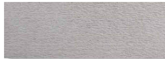
PARK LINEAL SILVER 31,6x90x0,95cm Butech recomienda junta / Butech recommends joint: Colorstuk Rapid n Cemento B22502013 / 100004305