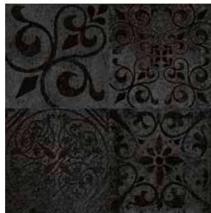
ANTIQUE BLACK S-R 59,6x59,6x1,1cm P1856931 / 100145842 G359 Butech recomienda junta / Butech recommends joint: Colorstuk Rapid n Negro B22502006 / 100004299