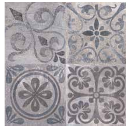
ANTIQUE ACERO S-R 59,6x59,6x1,1cm P1856935 / 100147629 G359 Butech recomienda junta / Butech recommends joint: Colorstuk Rapid n Manhattan B22502002 / 100004295