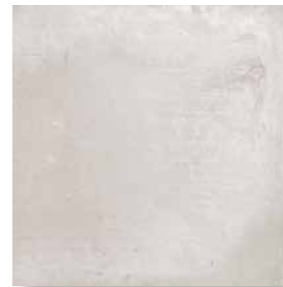
TRIBECA CALIZA S-R 80x80x1,2cm P1760061 / 100145837 G369 59,6x59,6x1,1cm P1856920 / 100145387 G354 Butech recomienda junta / Butech recommends joint: Colorstuk Rapid n Gris B22502013 / 100004305