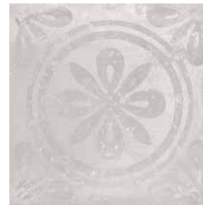
DECO TRIBECA CALIZA S-R 80x80x1,2cm P1760067 / 100148217 G372 59,6x59,6x1,1cm P1856925 / 100145530 G359 Butech recomienda junta / Butech recommends joint: Colorstuk Rapid n Gris B22502013 / 100004305