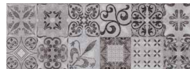
ANTIQUE GREY 31,6x90x0,9cm Butech recomienda junta / Butech recommends joint: Colorstuk Rapid n Cemento B22502013 / 100004305