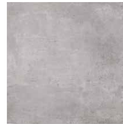
TRIBECA ACERO S-R 80x80x1,2cm P1760062 / 100145836 G369 59,6x59,6x1,1cm P1856923 / 100145386 G354 Butech recomienda junta / Butech recommends joint: Colorstuk Rapid n Manhattan B22502002 / 100004295