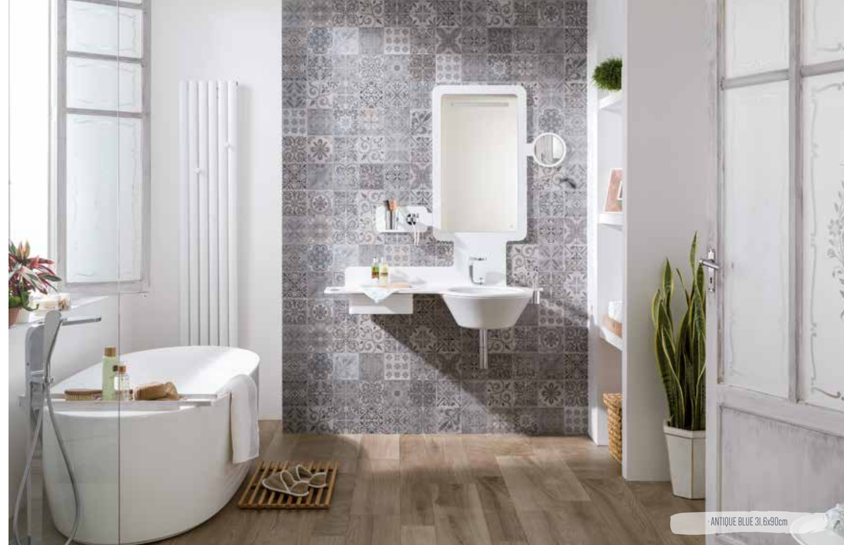
ANTIQUE BLUE 31,6x90cm