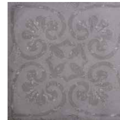
DECO TRIBECA SILVER S-R 59,6x59,6x1,1cm P1856924 / 100145531 G359 Butech recomienda junta / Butech recommends joint: Colorstuk Rapid n Cemento B22502004 / 100004297