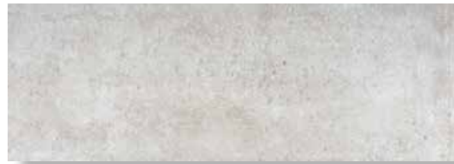
PARK ACERO 31,6x90x0,9cm Butech recomienda junta / Butech recommends joint: Colorstuk Rapid n Manhattan B22502002 / 100004295