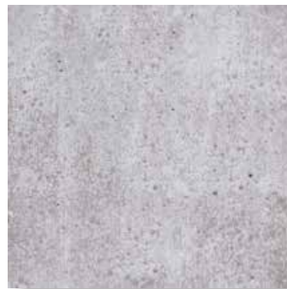
PARK ACERO S-R 59,6x59,6x1,1cm P1856927 / 100145726 G354 Butech recomienda junta / Butech recommends joint: Colorstuk Rapid n Manhattan B22502002 / 100004295