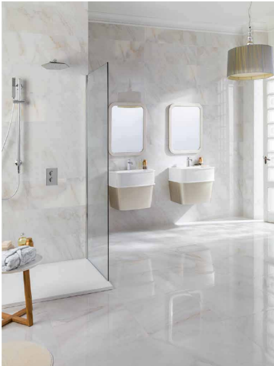
# BANI BLANCO 52, 6x50, 6cm