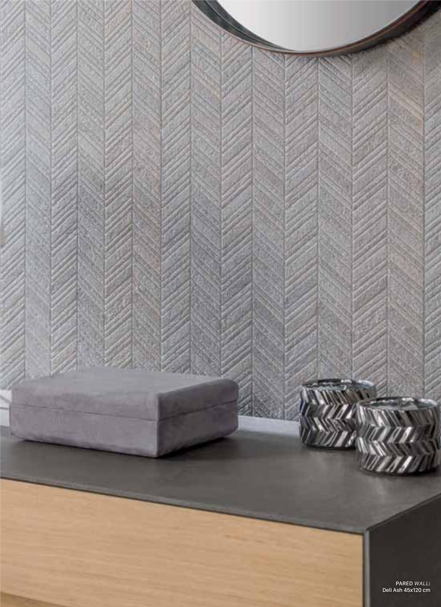
PARED WALL: Deli Ash 45x120 cm